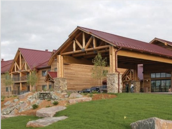
The Lodge at Cedar Creek officially opened June 18, 2004. It includes 140 rooms, banquet facilities and an indoor water park. It has since changed its name to Grand Lodge Waterpark Resort

Greenheck is the leading supplier of air movement and control equipment that includes fans, dampers, louvers, kitchen ventilation hoods, and energy recovery and make-up air units. Greenheck equipment is used in all types of commercial, institutional, and industrial buildings in applications from comfort ventilation to manufacturing processes.